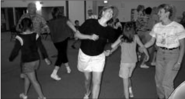
Good Food and Good Fun were had by all at the Annual Church Cookout held Sunday June 3. Activities included the ever-popular Dino Jump and Pop Walk for the kids.