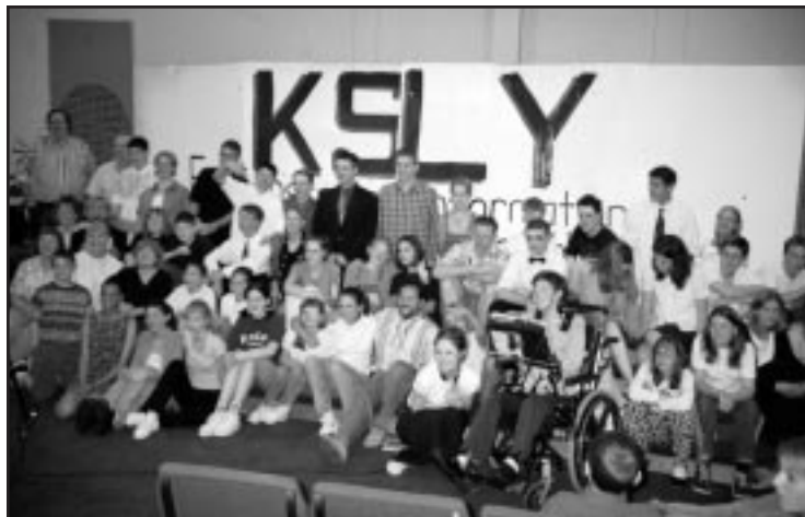
Over 60 youth took part in Youth Sunday services on April 9, 2000. SLY put on a great show and gave us all a new way to look at our lives as Christians through the SLY channel: KSLY.....and that is our final answer.